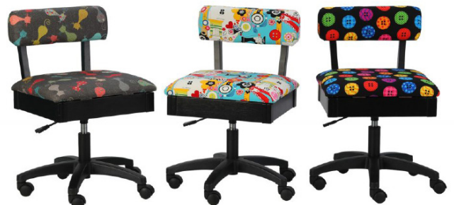
Cat's Meow, Sew Wow Sew Now & Bright Buttons Chairs

The cherry on top of your sewing sundae! Arrow's #1 Rated Height Adjustable Sewing Chair is a must have accessory for your dream sewing room! Cute, comfortable and convenient - our lovable chairs feature vibrant sewing themed patterns, 360° swivel access and lumbar support for long hours at your workstation. Don't look now, but under every seat cushion is a hidden storage compartment to store your notions and patterns! Available in 10 colors to perfectly match your sewing sanctuary!