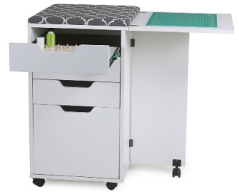
Kiwi Storage Cabinet

Every dream sewing oasis needs its cute, dependable accessories! Add even more convenience with a storage cabinet like Kiwi , featuring a built-in ironing board, cutting mat, thread drawers and a dedicated drawer to store your iron! Your dream sewing space won't be the same without it!