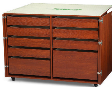
Dingo II Cutting Table

Kangaroo sewing cabinet - check! Now complete your studio with Kangaroo storage and cutting furniture, specially designed to complement your primary workstation. With extra storage and workspace, you can customize your sewing room to be stylish, comfortable, and even more productive!