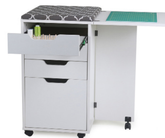
Kiwi Storage Cabinet

Every dream sewing oasis needs its cute, dependable accessories! Add even more convenience with a storage cabinet like Kiwi , featuring a built-in ironing board, cutting mat, thread drawers and a dedicated drawer to store your iron! Your dream sewing space won't be the same without it!