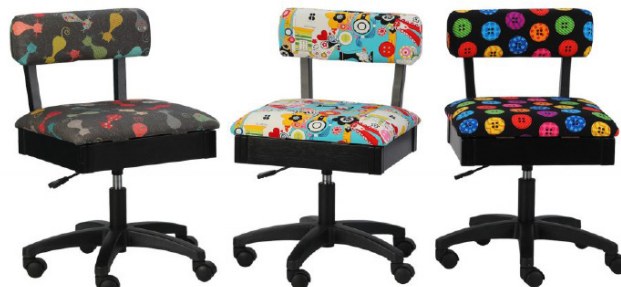
Cat's Meow, Sew Wow Sew Now & Bright Buttons Chairs

The cherry on top of your sewing sundae! Arrow's #1 Rated Height Adjustable Sewing Chair is a must have accessory for your dream sewing room! Cute, comfortable and convenient - our lovable chairs feature vibrant sewing themed patterns, 360° swivel access and lumbar support for long hours at your workstation. Don't look now, but under every seat cushion is a hidden storage compartment to store your notions and patterns! Available in 10 colors to perfectly match your sewing sanctuary!