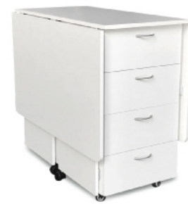
Kookaburra Cutting Table

Every dream sewing oasis needs functional, dependable accessories! Add even more convenience with a cutting table like Kookaburra , featuring two fold out leaves, four self-closing drawers, four rear removable shelves, and locking casters for easy mobility! Your dream sewing space won't be the same without it!