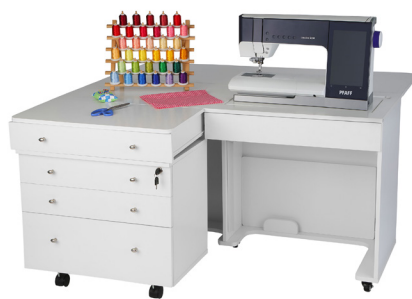
Kangaroo & Joey II Sewing Cabinet

Kangaroo sewing cabinet - check! Now complete your studio with Kangaroo storage and cutting furniture, specially designed to complement your primary workstation. With extra storage and workspace, you can customize your sewing room to be stylish, comfortable, and even more productive!